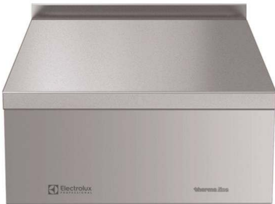
589161 (MCNABBFOOO) Closed Work Top, one-side operated with backsplash